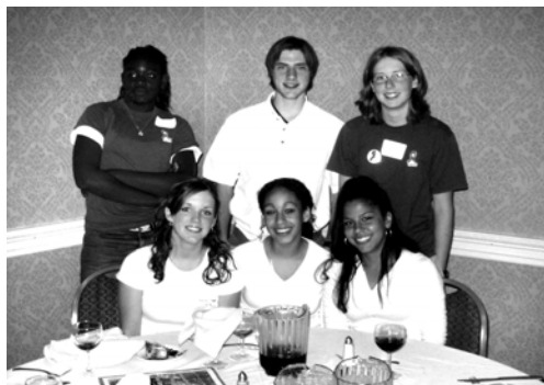
➤ Past YRTA Members at youth conference X